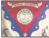
Lowell Clawson Mayor

Town of Batroil 1101 Antelope Drive PO Box 58 Batroil, WY 82322 307-324-7653 www.TownOfBatroil.com